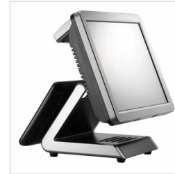
Powerful 1.8 Ghz Dual-Core Processor