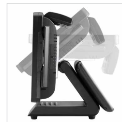
Convenient Wall Mount and Wide Tilt Angle