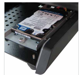
Engineered for Reliability with Fanless Technology