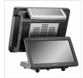
Flexible Modular Design and Dual Display Support