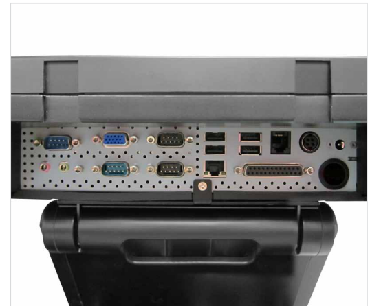
Dual Cash Drawer Support